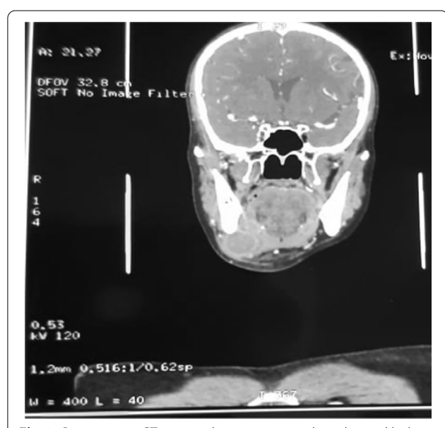
Fig. 2 Preoperative CT scan outlining a mass in the submandibular area