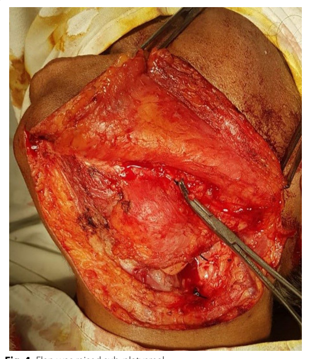
Fig. 4 Flap was raised sub-platysmal

The excised mass was sent to the laboratory for histopathological examination. The excised mass was oval and measures 2 \times 2 \times 1.8 cm. It includes the submandibular gland along with nodes. The histopathology revealed a lesion with the cystic component which is lined by stratified squamous cells showing focal atypia. In some areas, these cells are associated with lymphocytes. The central cystic area sows extensive keratin pearls and flakes of keratin. The squamous cells have round to oval nuclei with vesicular chromatin and occasionally prominent nucleoli. Focal disruption of epithelial lining is present. So final diagnosis of the lymphoepithelial cyst was made (Fig. 7).