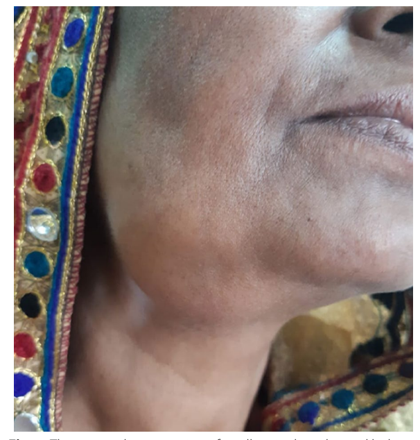
Fig. 1 The extraoral presentation of swelling in the submandibular region

Therefore, in the light of history, examination, and investigations excisional biopsy was planned. The patient was referred for general anesthesia fitness and has been advised for complete blood count, Hepatitis screening, Covid PCR, Chest radiograph, and Urea creatinine and electrolytes. She was operated on under general anesthesia. Wide excision of the mass was performed; under AAA measures, prep and drape were done. A transverse incision was marked (Fig. 3) and