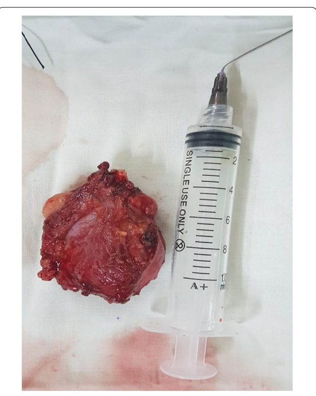
Fig. 5 Excised lesion along with submandibular gland