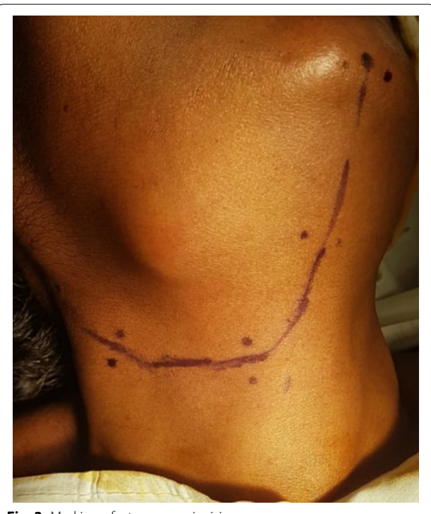
Fig. 3 Marking of a transverse incision