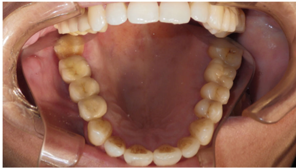
Fig. 4 Cemented FPD in place