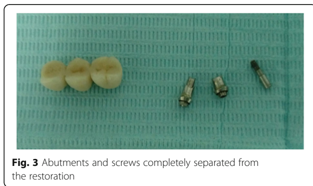
Fig. 3 Abutments and screws completely separated from the restoration