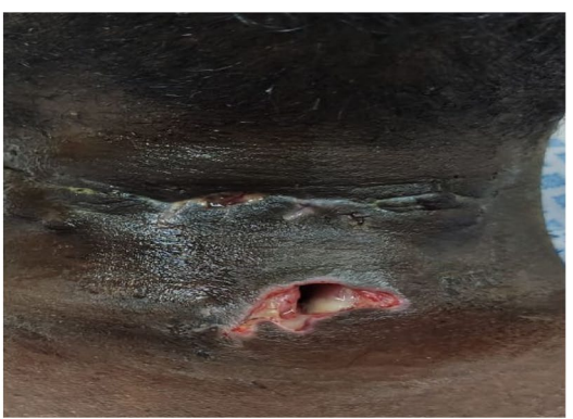
Fig. 3 Wound at day 12 (Right) and day 20(Left) post debridement and vacuum dressing