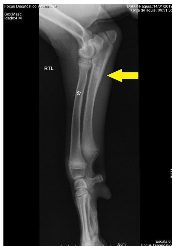
Fig. 1 Radiography, right thoracic limb (RTL), lateral projection (dog #1): increased radiopacity compromising ulnar medullary cavity with prominent irregular radiopaque patches on proximal diaphysis and caudal cortical thickening (yellow arrow), suggesting panosteitis. Note oblique radiolucent line on radius cortical bone characterizing nutrient foramen (white asterisk)

Radiographs revealed medullary cavity increased radiopacity with ill-defined borders and loss of normal trabecular pattern in all affected bones: right ulna (dogs #1 and #3; Fig. 1) and right humerus (dogs #2 and #4; Fig. 2). Radiographic diagnosis suggested panosteitis in all four cases.